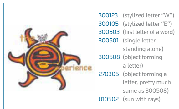
Figure 2: Design coding example using Thomson CompuMark system. Note the coding of stylized lettering, which cannot be coded using standard system.

Thomson CompuMark’s proprietary, “enhanced” design coding enables analysts to deliver results that are more precise, accurate and relevant.