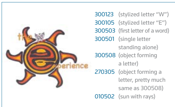
Figure 2: Design coding example using Thomson CompuMark system. Note the coding of stylized lettering, which cannot be coded using standard system.

Thomson CompuMark's proprietary, "enhanced" design coding enables analysts to deliver results that are more precise, accurate and relevant.