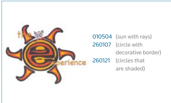
Figure 1: Design coding example using standard system. Note that only three major elements are coded.

See the figures below for a comparison of the standard coding system and Thomson CompuMark’s proprietary coding system.